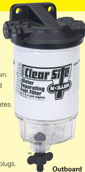
Outboard Part No. 033314-10

WARNING • Outboard engine use only! • Not for use with diesel fuel!