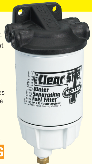
Inboard Part No. 033339-10

*Filter canister will not work with Racor® filter heads